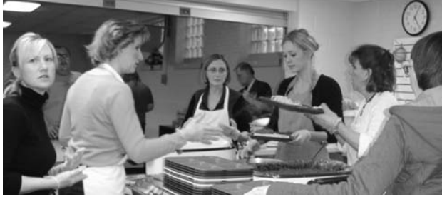
Table on January 30, 2007. We had 12 volunteers in the kitchen and we had fun! We still don't know why the fire alarm went off and we had to evacuate the building. It happened just as we were in "crunch time" to get the meal ready. We pulled it off like pros anyway and thankfully there was no fire! We made a homemade meal of spaghetti and meat sauce with bread sticks, mixed vegetables and bananas. Everyone loved the meal and we are invited back again! Thanks to JLEC for sponsoring the meal and all of our kitchen helpers.

Sustainers, provisionals and actives cooked, served and cleaned up at The Community